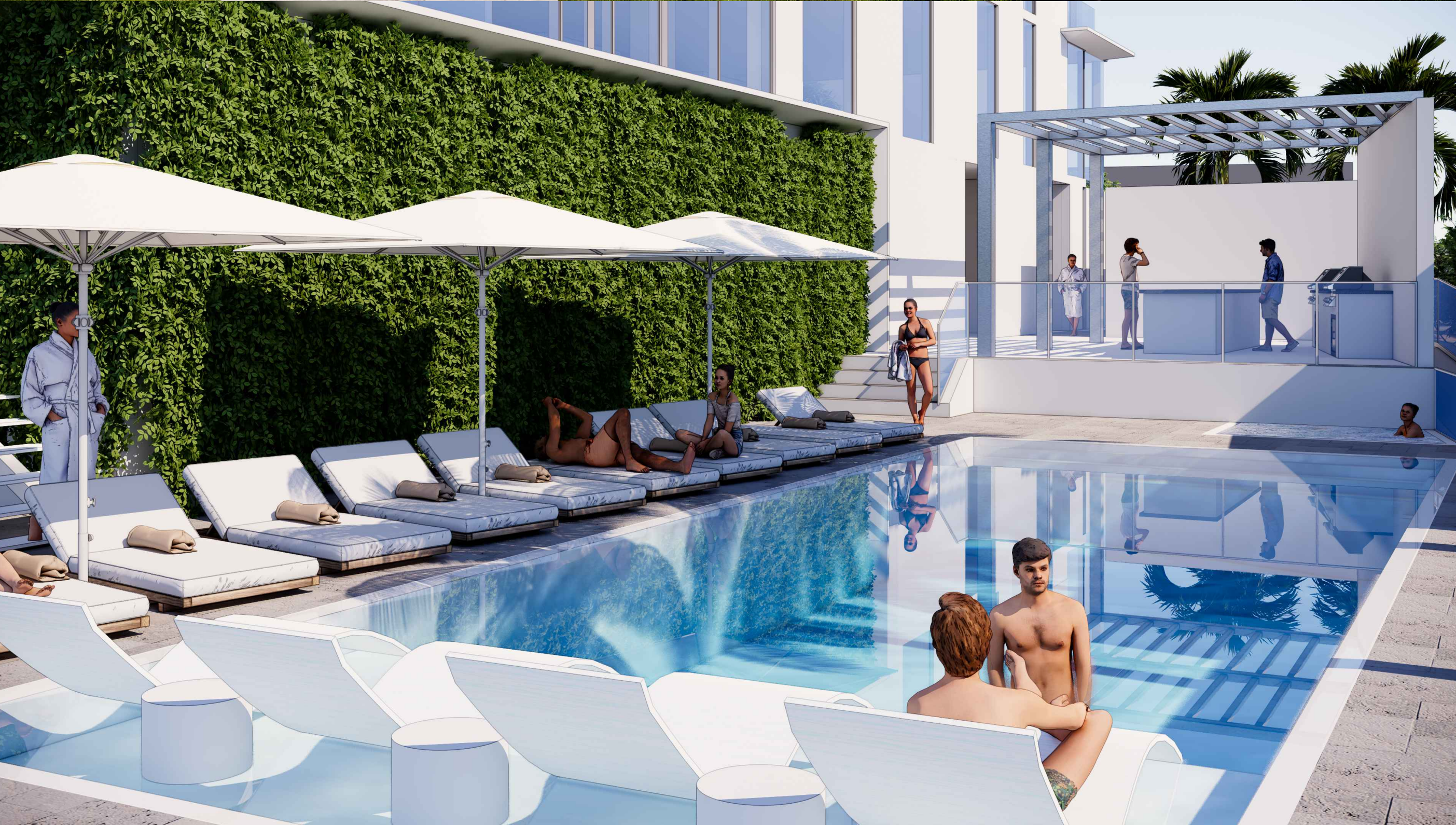
View of the green wall facing the pool deck