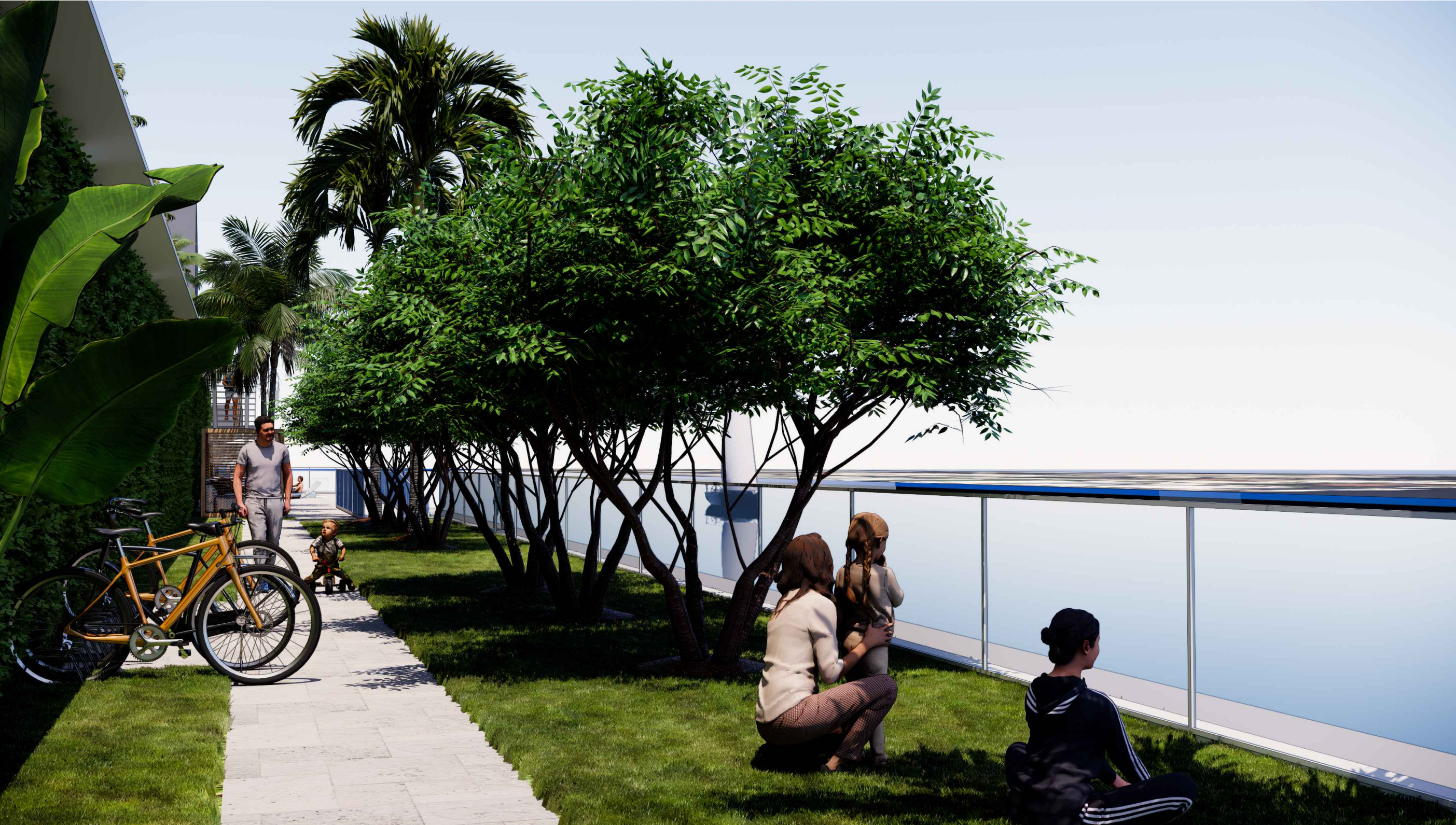
View looking south-west of Exterior Promenade beside the Canal

Digitally signed by Stephane L'Ecuver Date: 2024.06.11 10:09:17-0400'