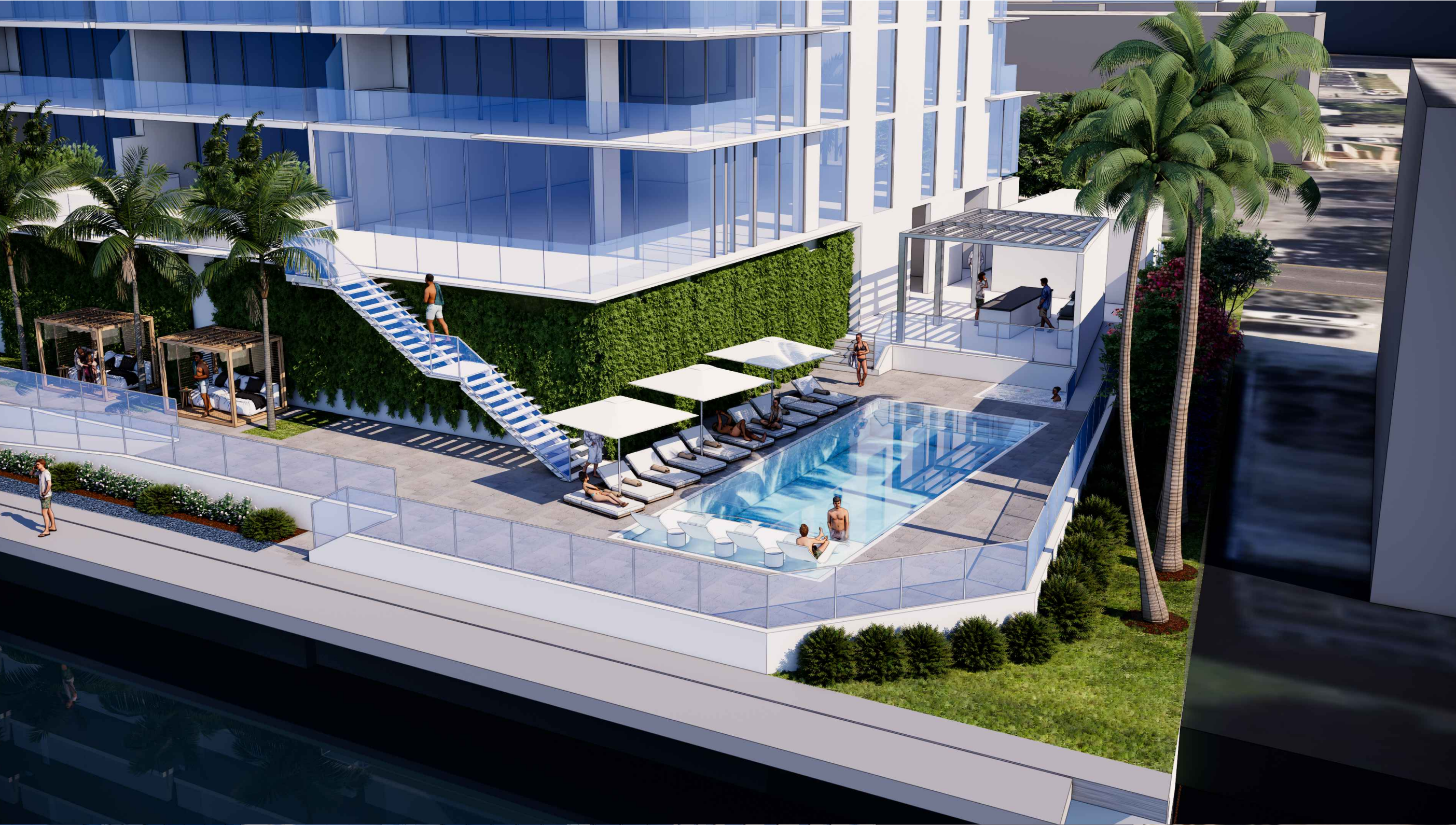
View of Pool deck from South-West Aerial