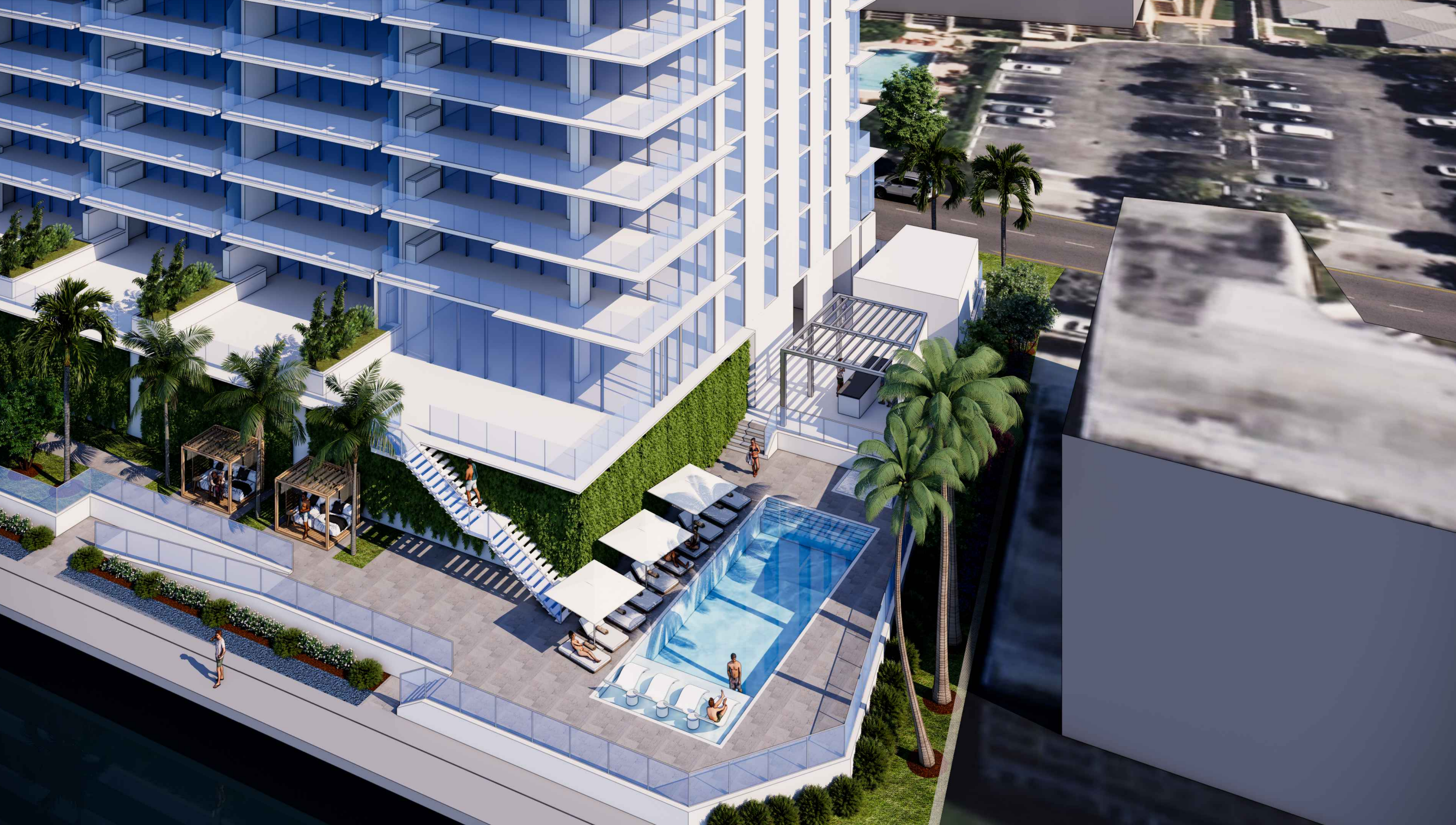
View of pool deck, from canal